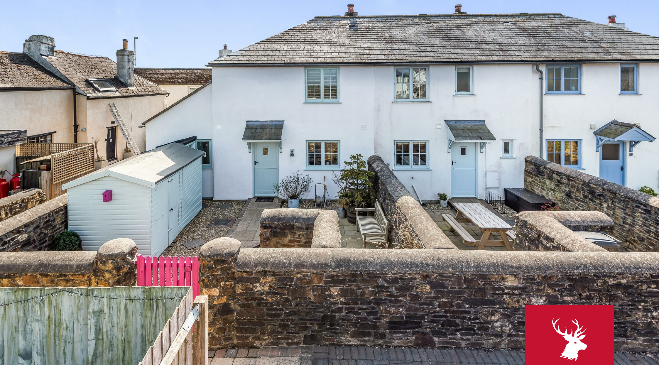
2, Pickwick Cottages